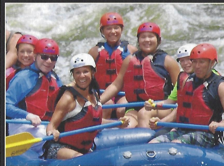
DAD ENJOYING LIFE ON A SKI LIFT IN THE SMOKEY MOUNTAINS 2015 DAD AT UTHS 1957-1960 DAD LOVED HIS GRANDCHILDREN - WHITWATER RAFTING 2015 OUR WEDDING 1998 ~ INDUCTION TO HALL OF FAME 1990